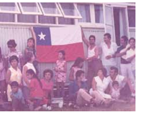
above: Celebration of Chilean National Day. Fairy Meadow Hostel, 18 September 1971.

Of all the community sporting traditions brought to the Illawarra, football (soccer) was the most popular and enduring. Already the most popular football code, due to migration from England, Scotland and Wales in the 19th century, post-war migration from Europe ensured that football (soccer) continued to flourish in the Illawarra. Many of the clubs were (and