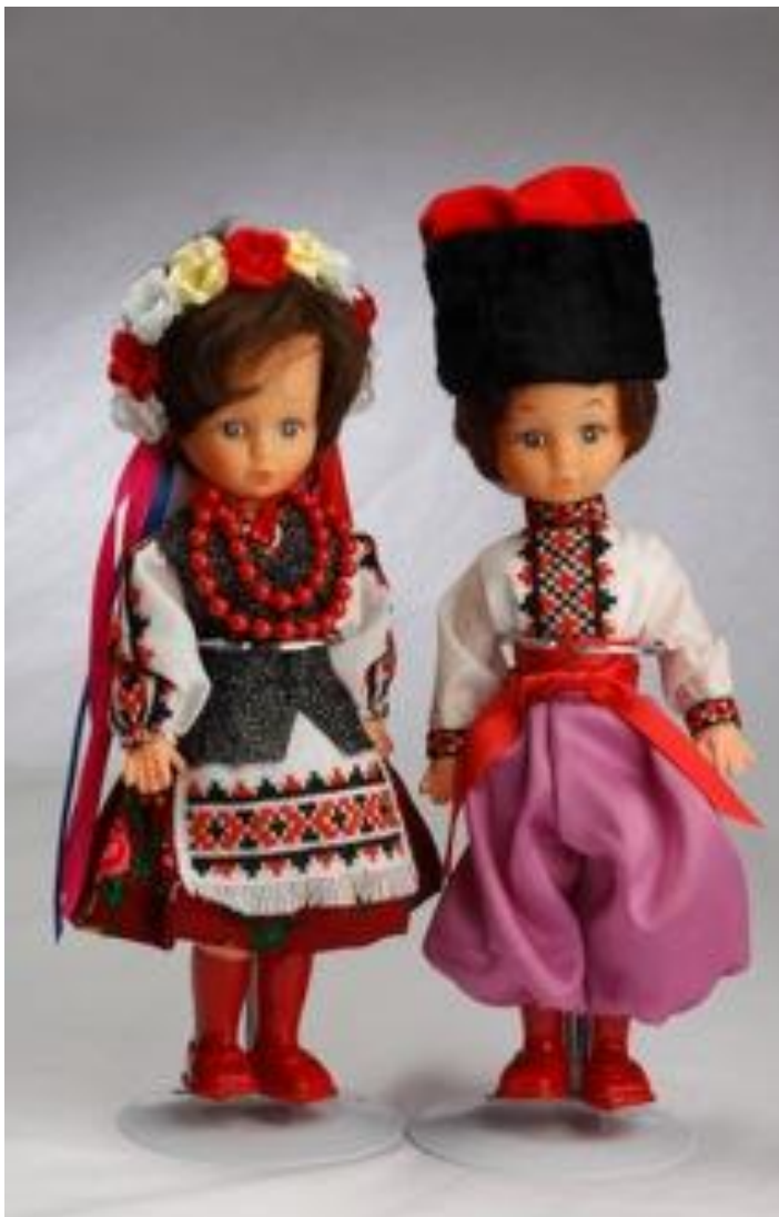
Image: Dolls in Ukrainian costume