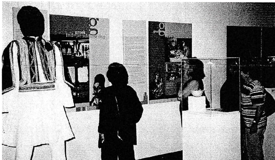
Photo's: Celebrations-spirit of communities exhibition opening night.